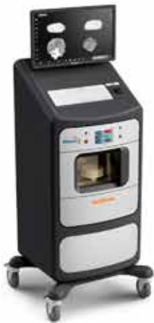
VisionCT™ specimen imaging system